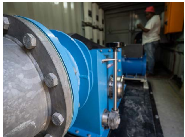
KwaMadiba is a run-of-river, modular unit which turns the potential energy of water flowing into clean electricity.

So far, work on developing the atlas indicates there are existing and new opportunities for hydropower in the country. There are, for instance, opportunities at existing dams and weirs as